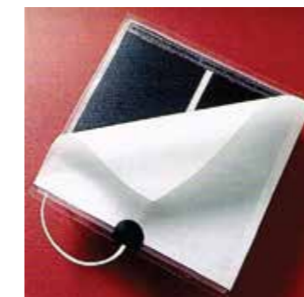
SELF ADHESIVE To be placed on back of mirror