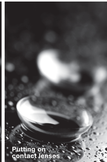
Putting on contact lenses